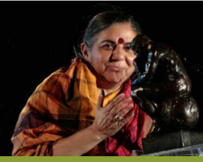
andana Shiva (Indian environmental activist