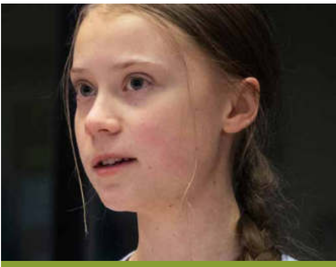
Greta Thunberg (Fridays for Future)

Examples of potentially likeminded people from our network who we are currently approaching.